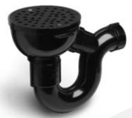
ABS Floor Drain With P-Trap