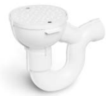
PVC Floor Drain With P-Trap